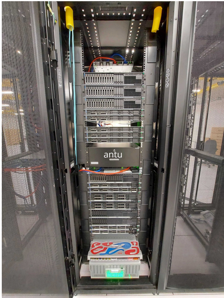
FIGURE 2: antu cluster