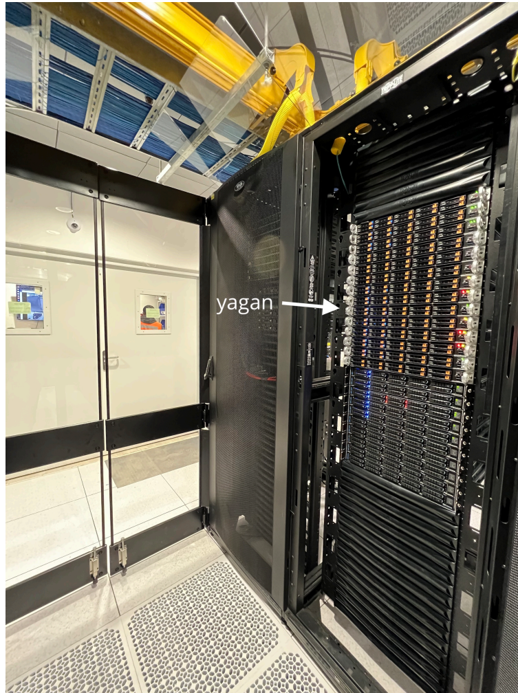
FIGURE 3: clusters at the summit

The computing cluster at the summit is called yagan. It has a capacity of 576 cores and 2.2TB of Ram.